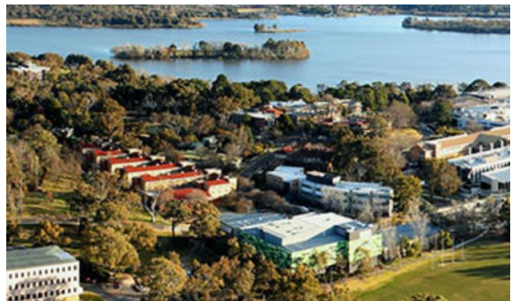
Figure 1: ANU Acton Campus

The Australian National University (ANU) was founded in 1946, in a spirit of post-war optimism, with the role to help realise Australia's potential as the world recovered from a global crisis.