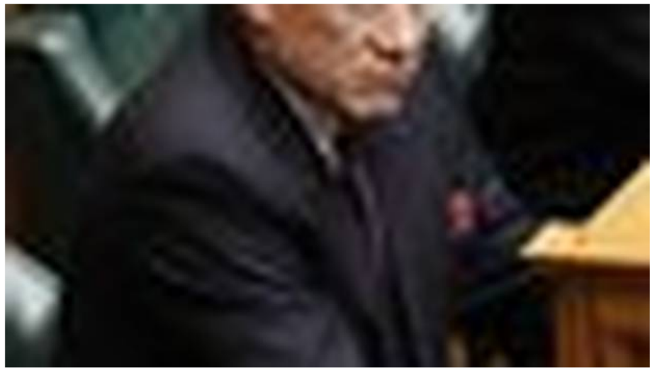
New Zealand First Party leader Winston Peters.