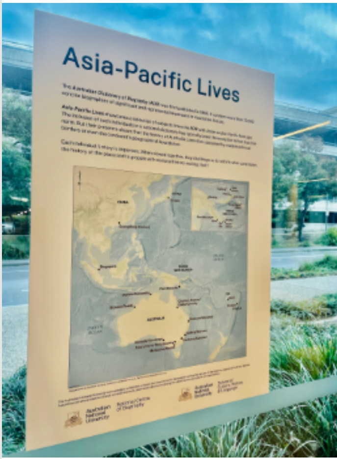
Asia-Pacific Lives exhibition panel displaying map produced by CartoGIS.

Immersia has now come to a close, but if you missed it, never fear! The exhibition is now on display at the Menzies Library. Drop by and take a look!