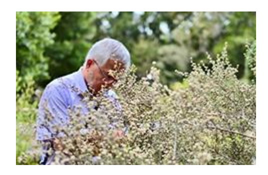
End of year walk and lunch at the National Botanical Garden