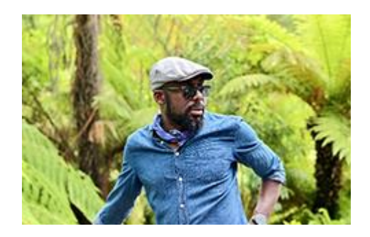
Here are some of our explorers.