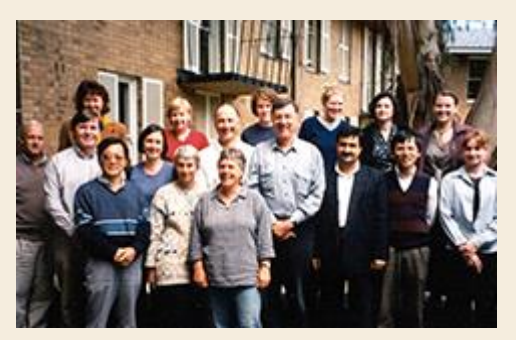
Flashback – how many demographers do you recognise and where are they now?