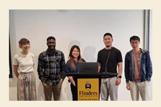
ECR DEMO Symposium was held in Flinders University (Adelaide) on November 19, just before the APA conference.