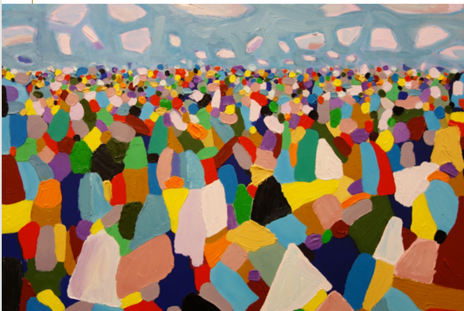
The Australian Crowd, by Stephen Baxter (2014)

The NCB News is the monthly newsletter of the National Centre of Biography. Got biographical news to share? Send us an email at ncb@anu.edu.au .